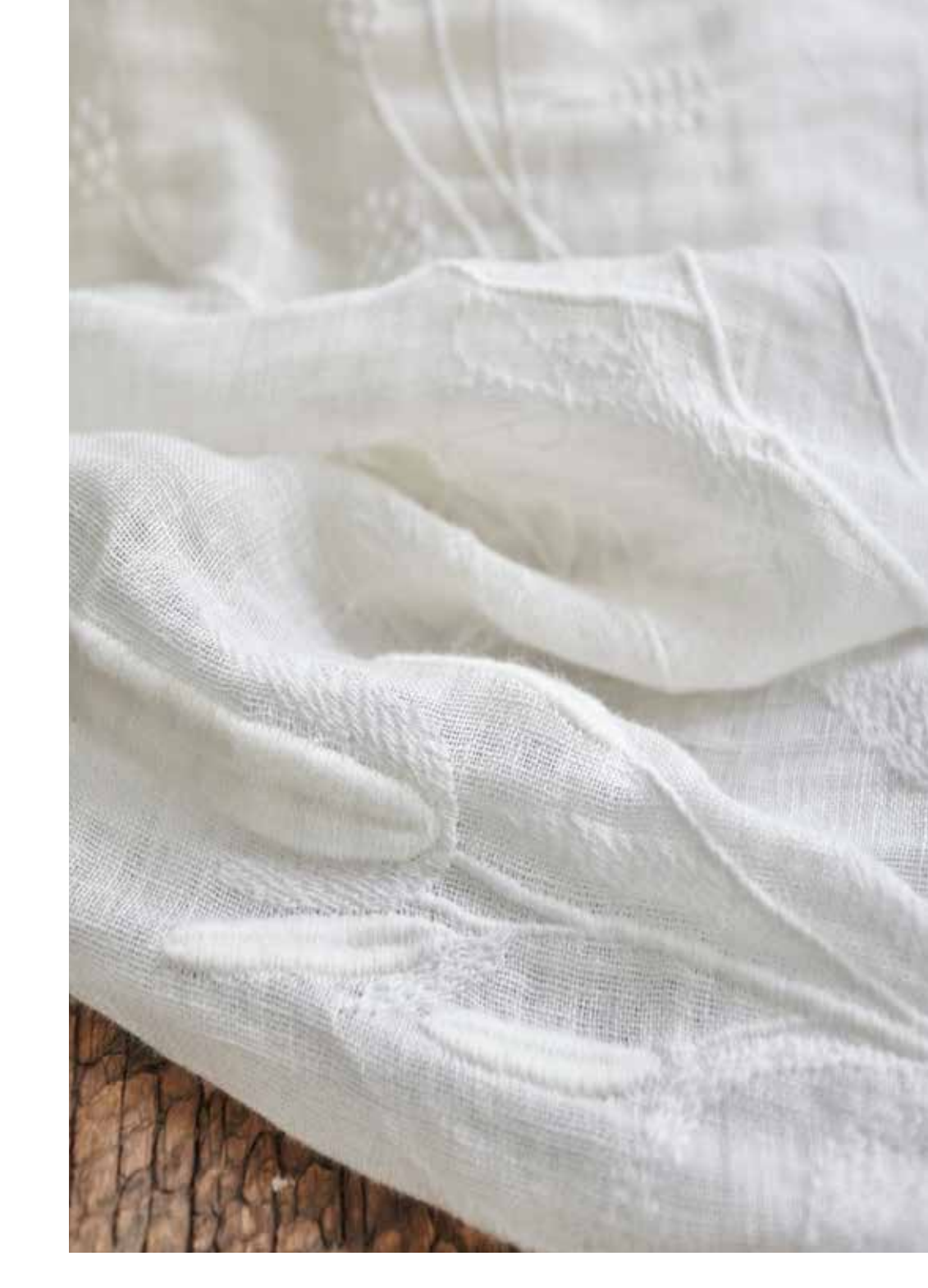
Evoking the Mediterranean landscape with its natural design, this delicate embroidery seems to sprout from the ground, creating a unique atmosphere with the passage of light.