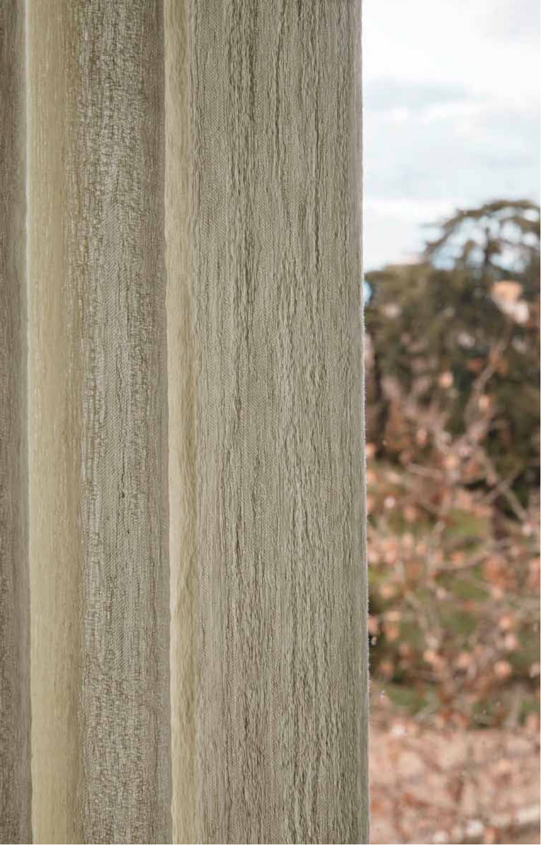
The delicacy of linen and the durability of cupro make this curtain fabric the most sophisticated reference in the collection. A jacquard with a subtle satin look and organic texture.