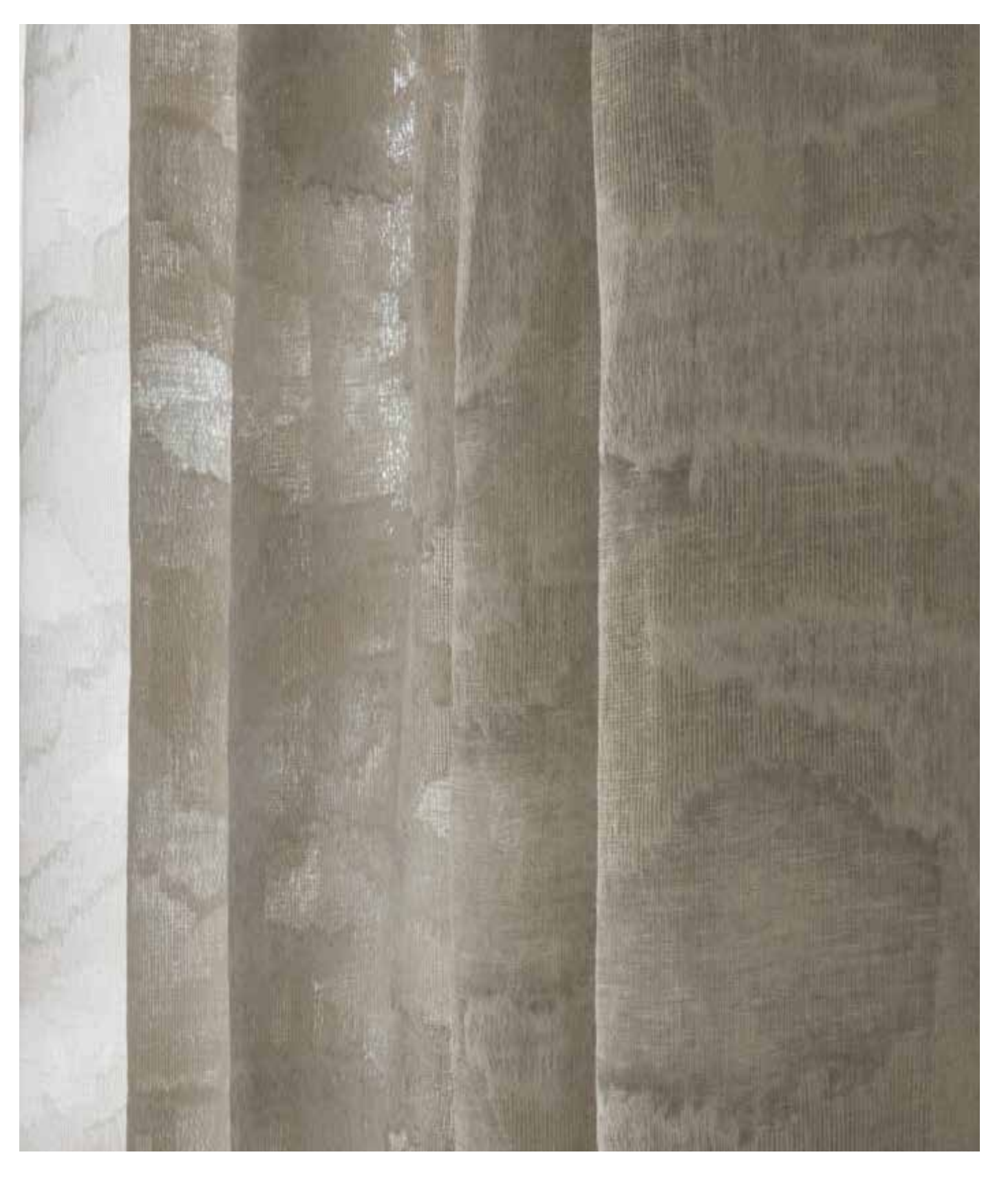
Beautiful jacquard in fil coupé with a pleasant, vaporous feel. The volatile density and ephemerality of clouds are captured in this design, whose abstract forms add depth and movement to this cotton and linen fabric.