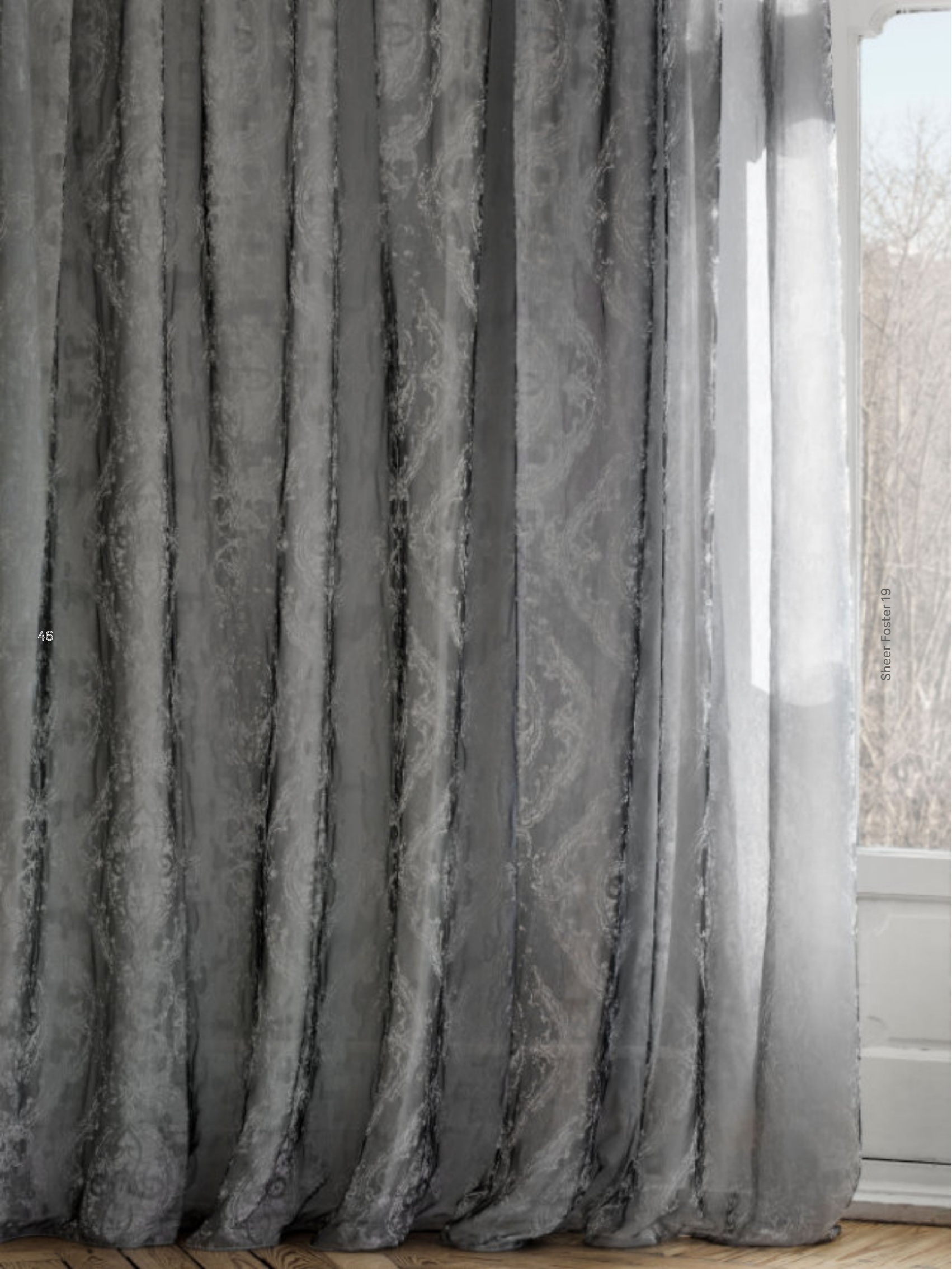
Sheer Foster 19