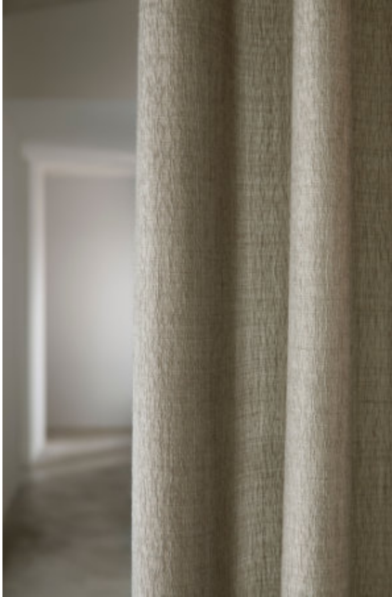
Sheer Testa 01