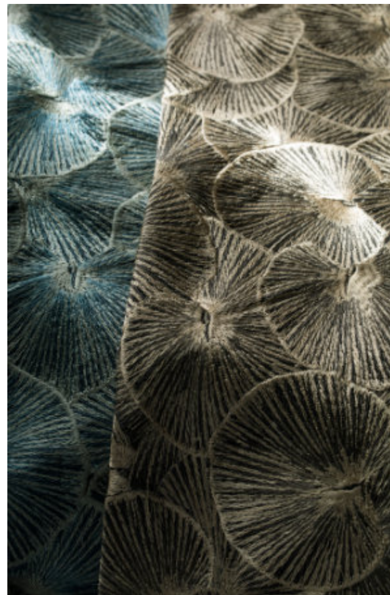
Lotus 04, Lotus 05