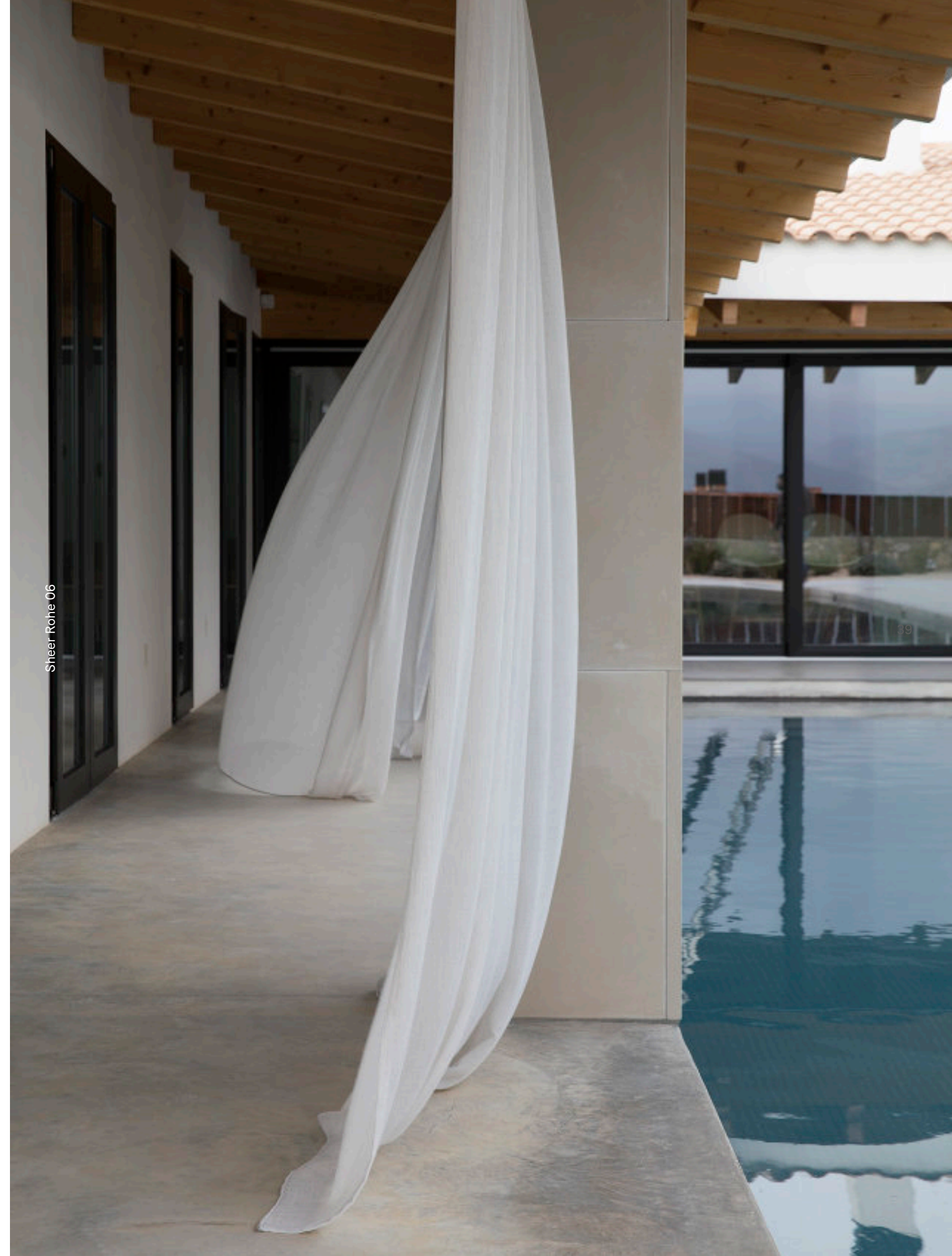
Sheer Rohe 06