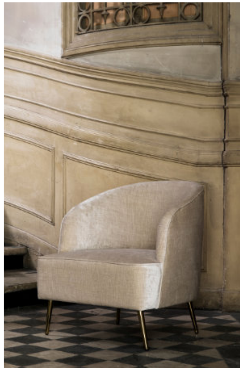
Armchair Dandy 06