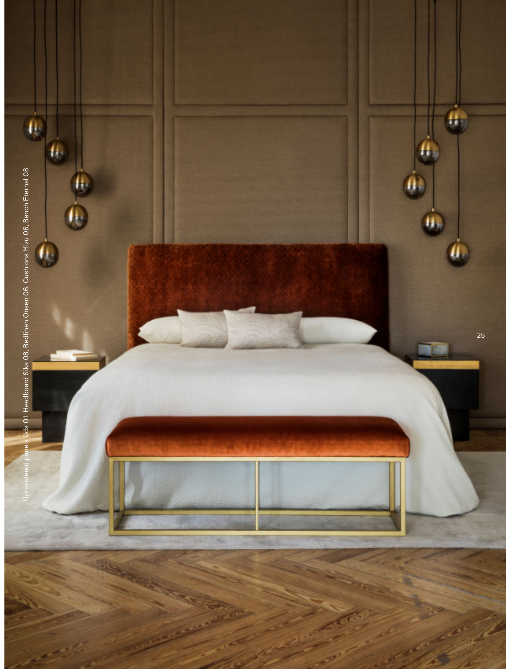
Upholstered panels Uda 01, Headboard Sika 08, Bedlinen Onsen 06, Cushions Mizu 06, Bench Eternal 08