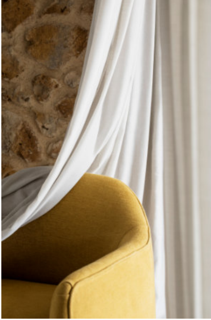
Sheer Moneo 09