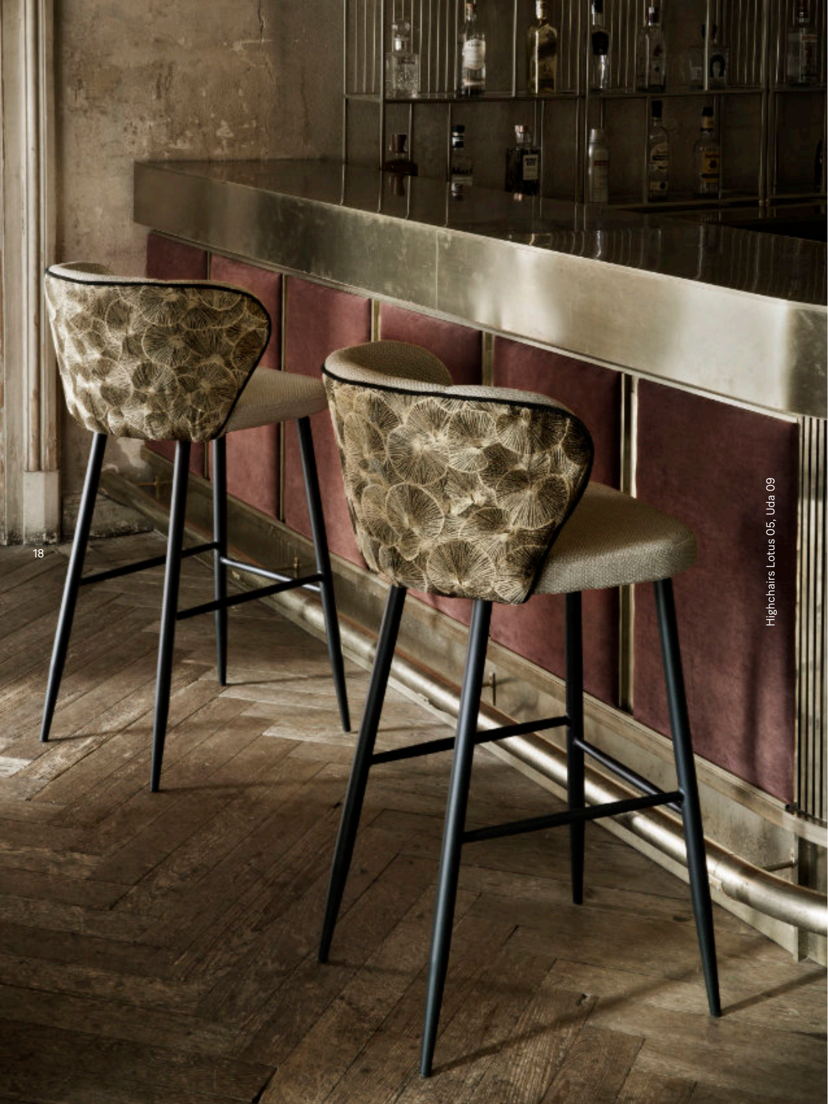
Highchairs Lotus 05, Uda 09