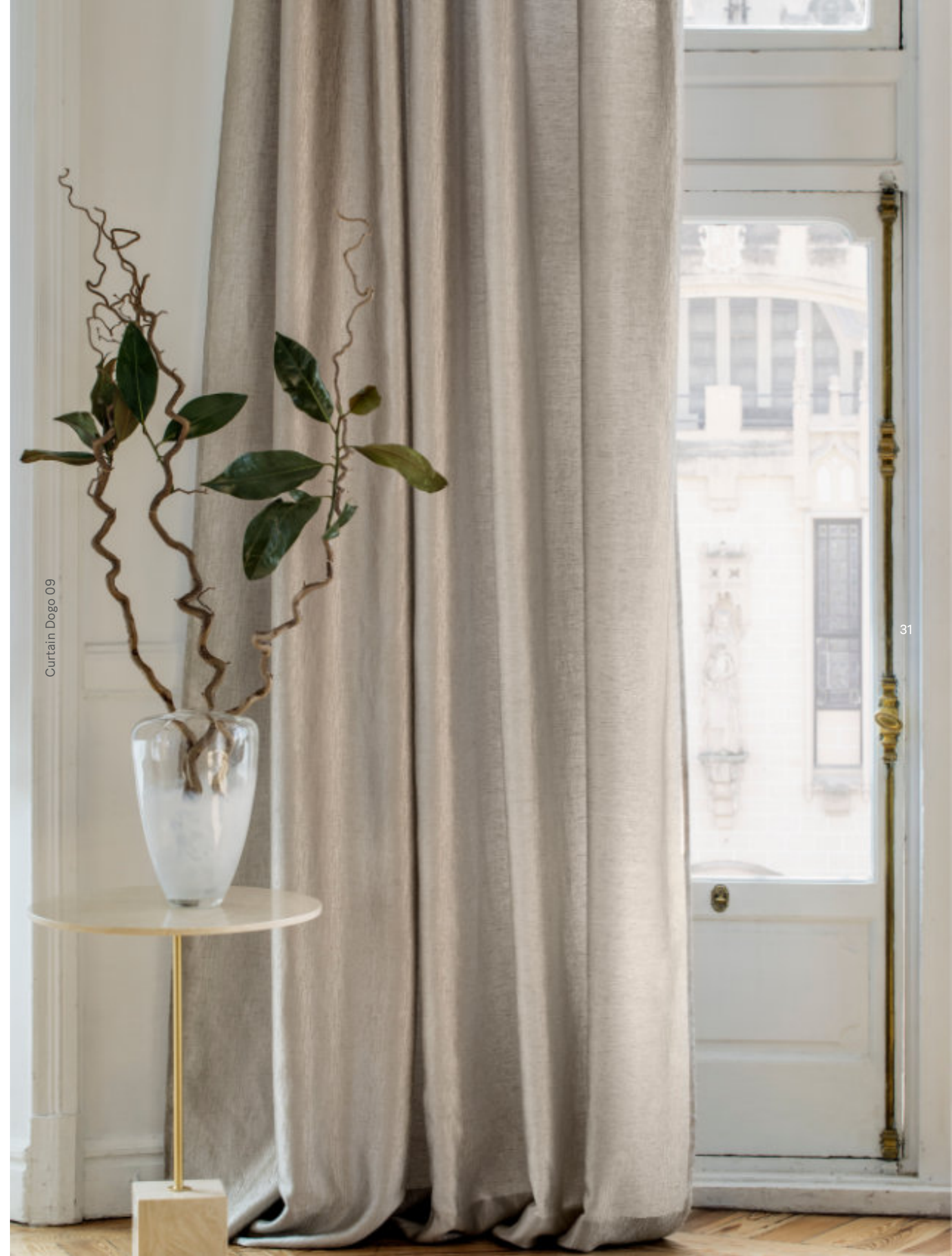
Curtain Dogo 09