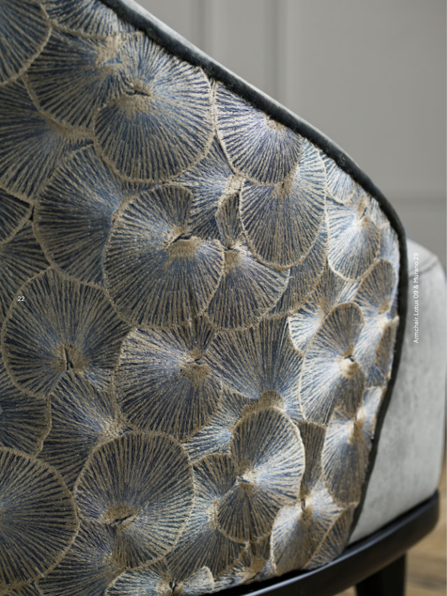
Armchair Lotus 09 & Murano 29