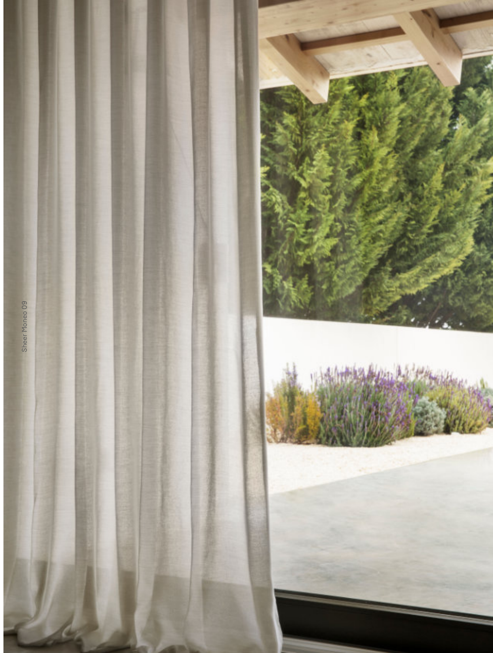
Sheer Moneo 09