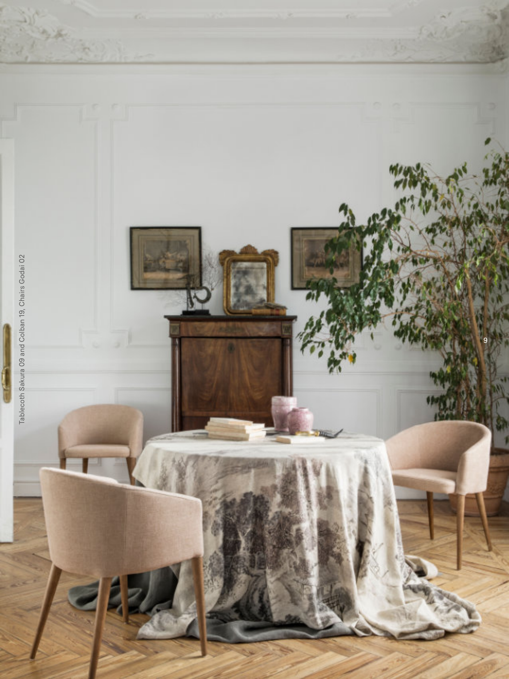
Tablecloth Sakura 09 and Colban 19, Chairs Godai 02