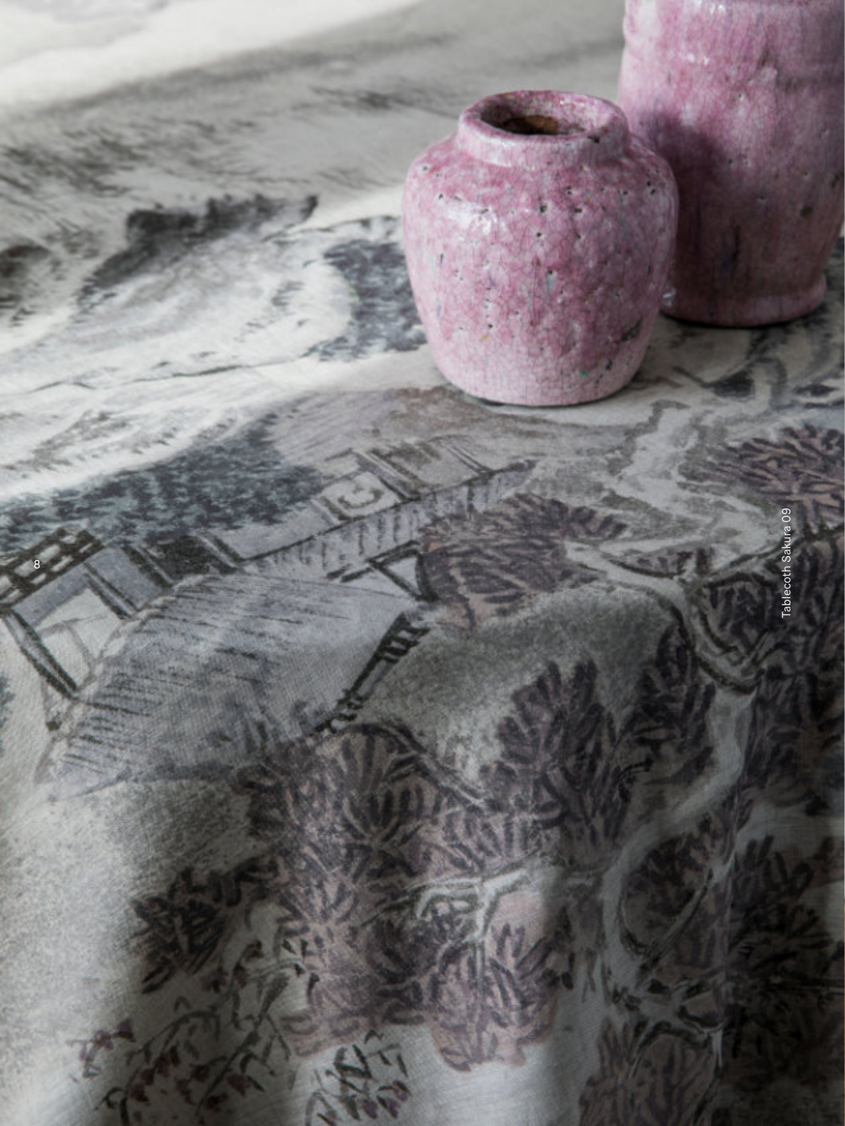
Tablecloth Sakura 09