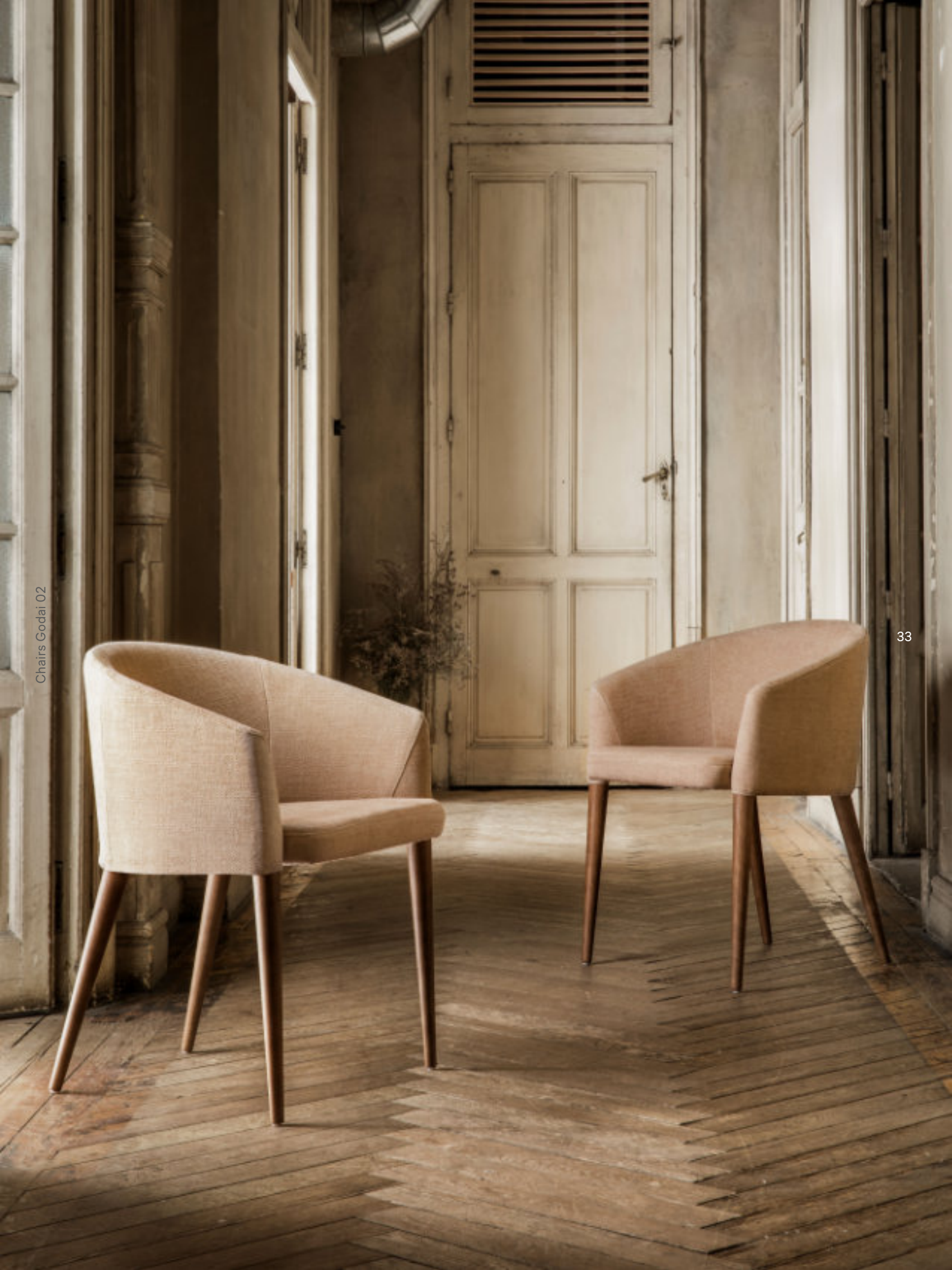
Chairs Godai 02