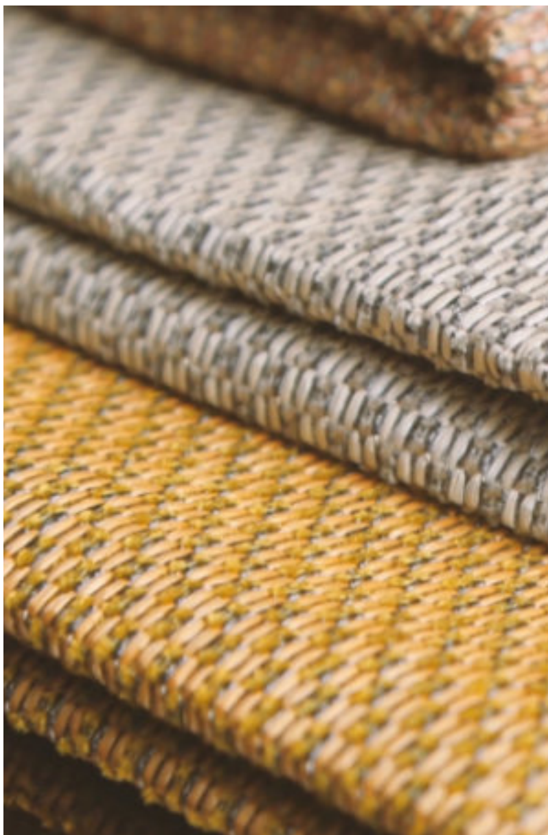
Uda 05, Uda 09, Uda 06