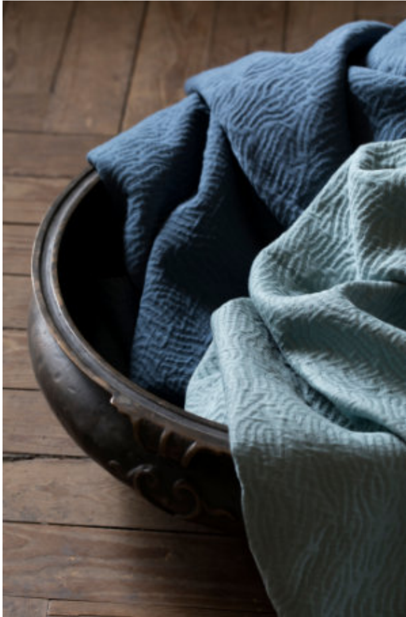
Onsen 04, Onsen 14