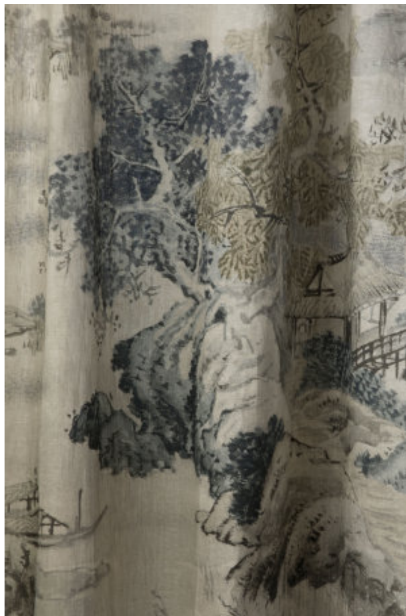
Curtain Sakura 04