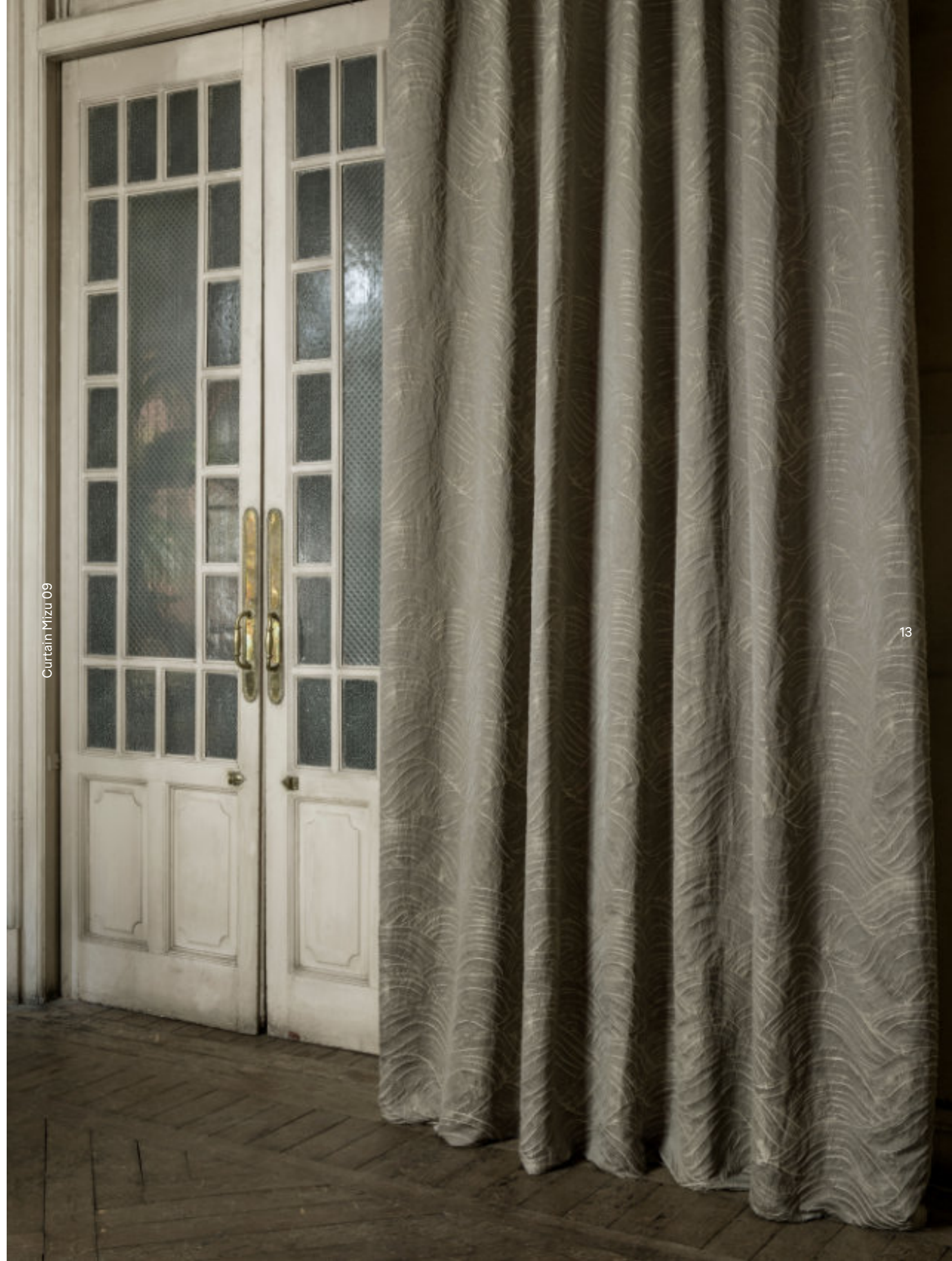
Curtain Mizu 09