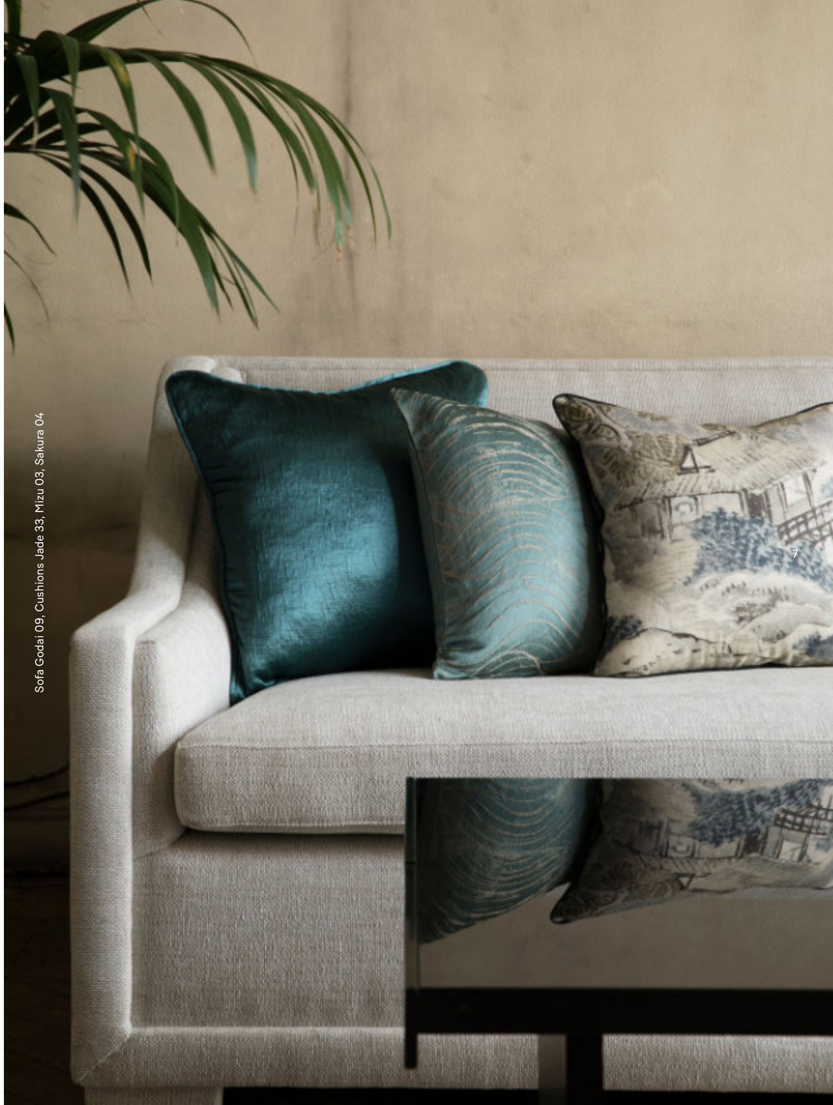
Sofa Godai 09, Cushions Jade 33, Mizu 03, Sakura 04