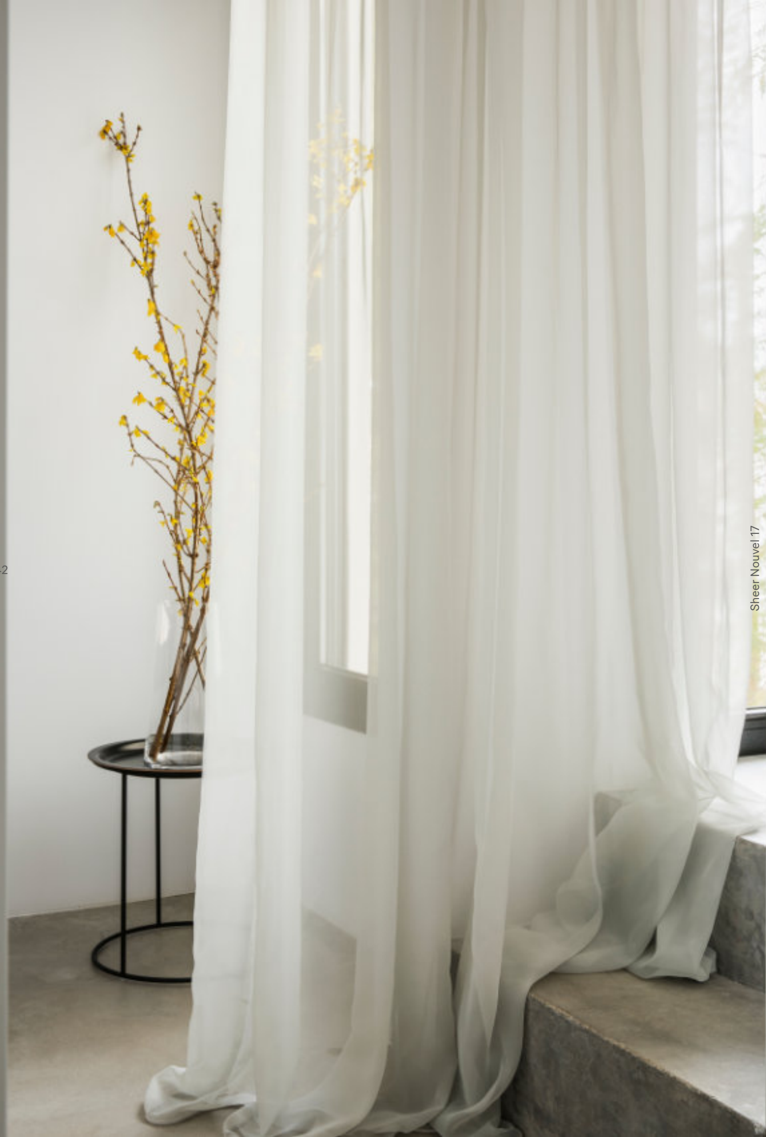
Sheer Nouvel 17