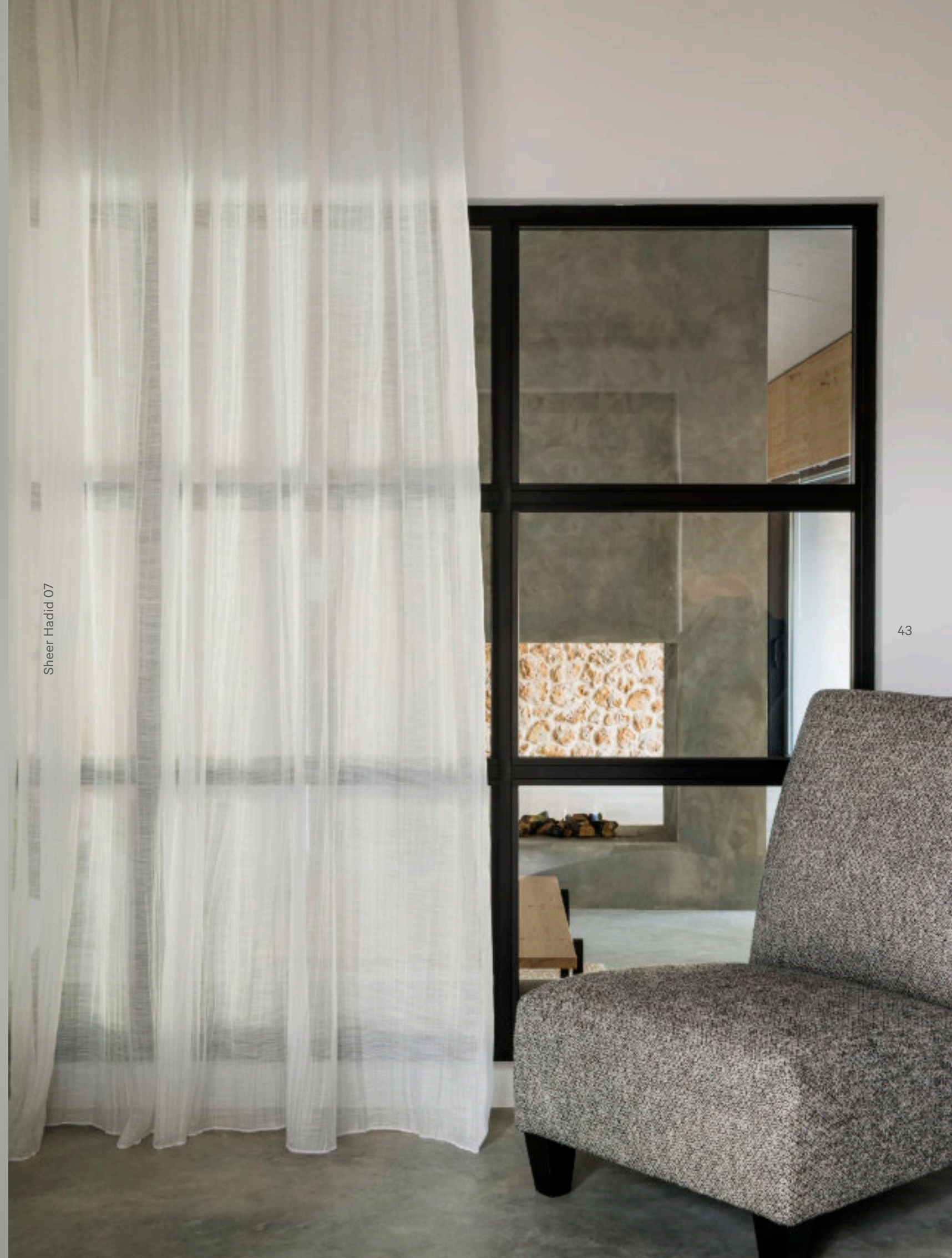
Sheer Hadid 07