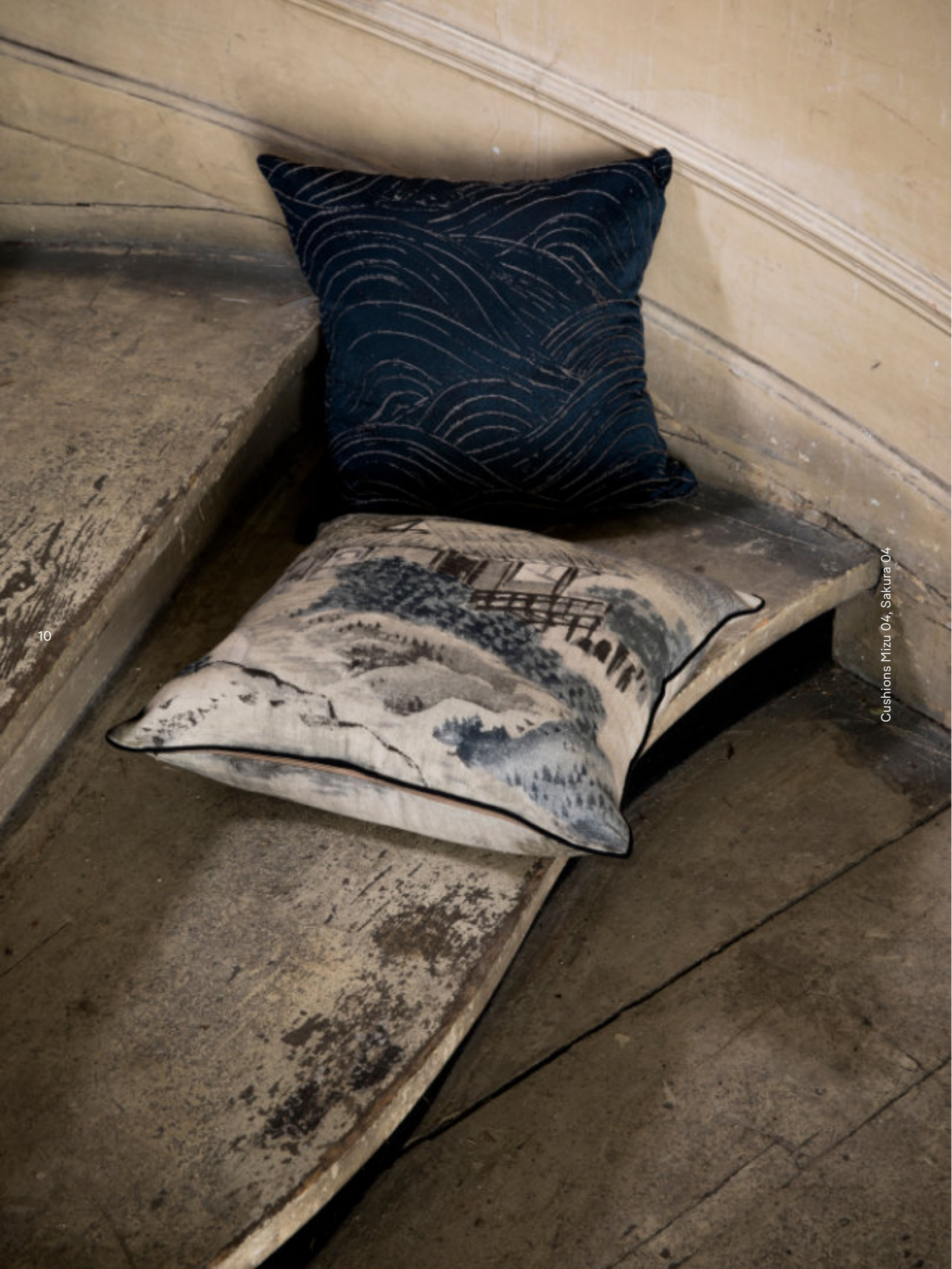
Cushions Mizu 04, Sakura 04