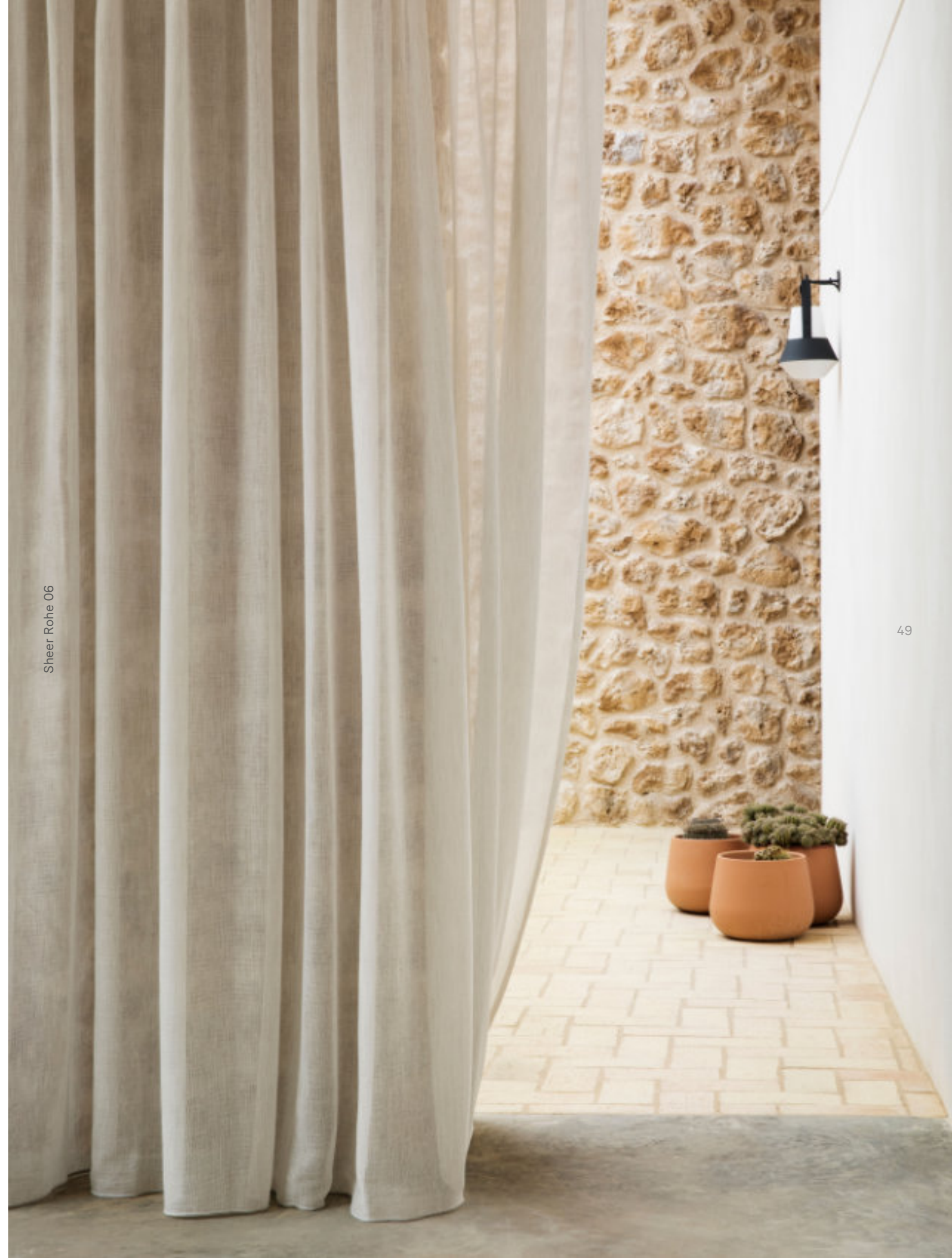
Sheer Rohe 06