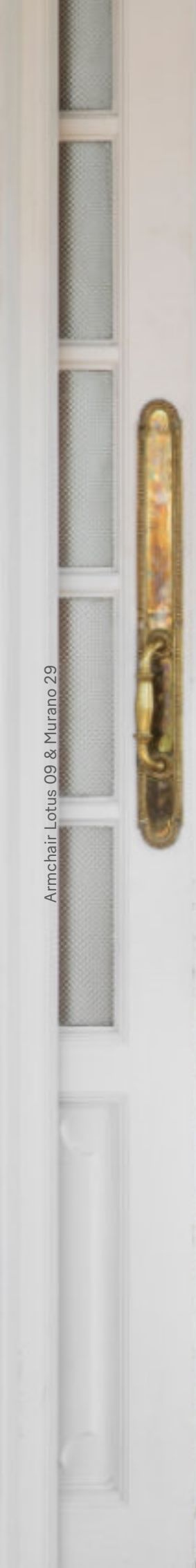
Armchair Lotus 09 & Murano 29