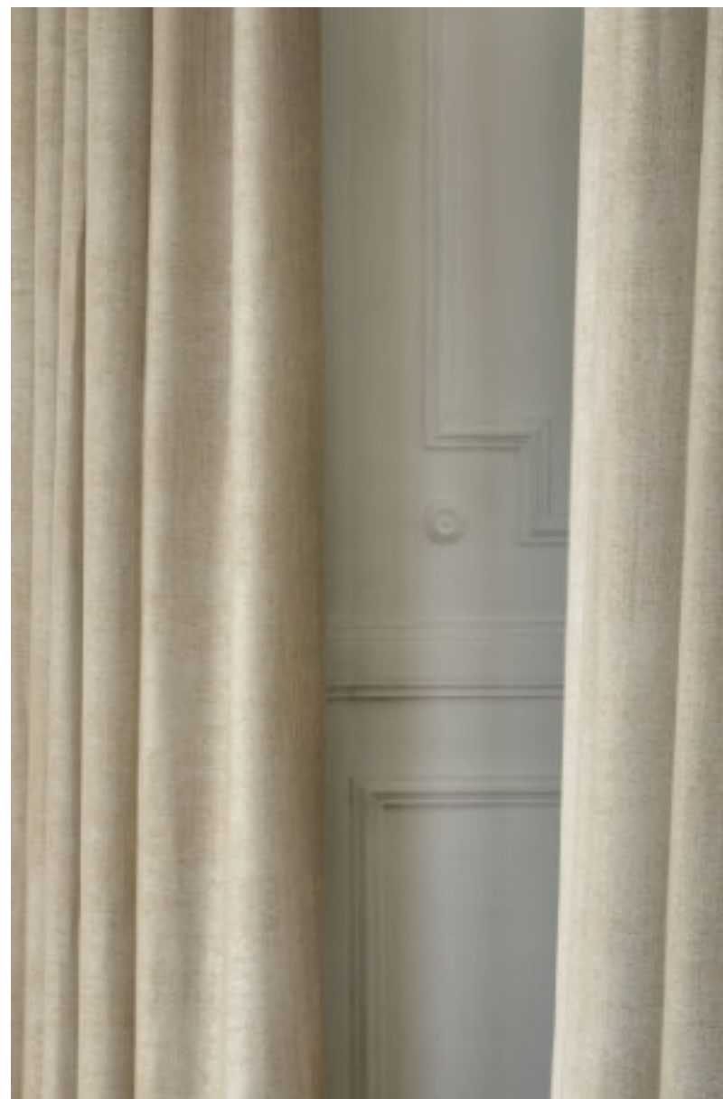
Sheer Wright 16