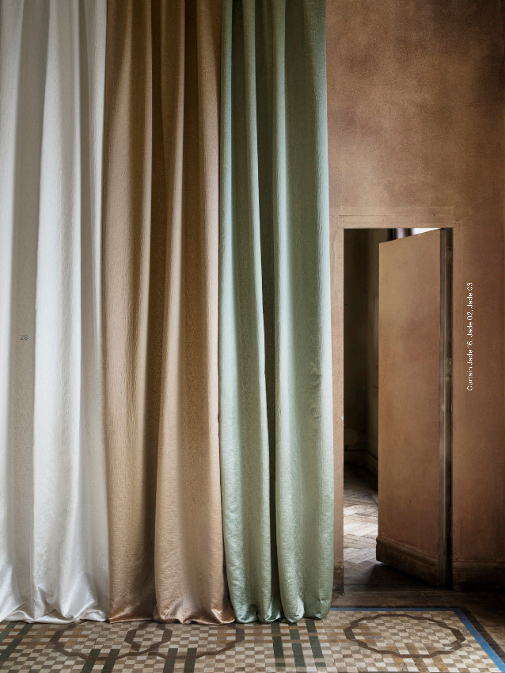
Curtain Jade 16, Jade 02, Jade 03