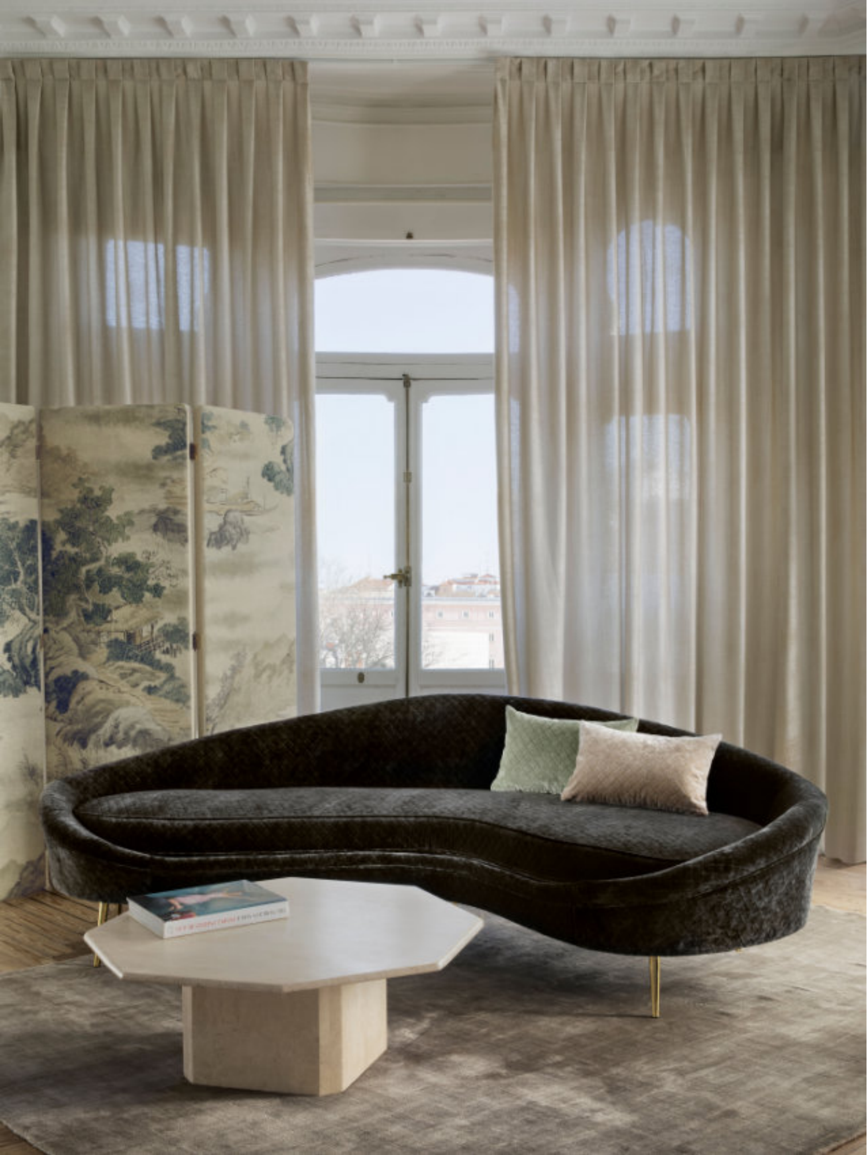
Sofa Sika 13, Cushions Sika 03, Sika 02, Folding screen Sakura 03, Curtain Wright 16