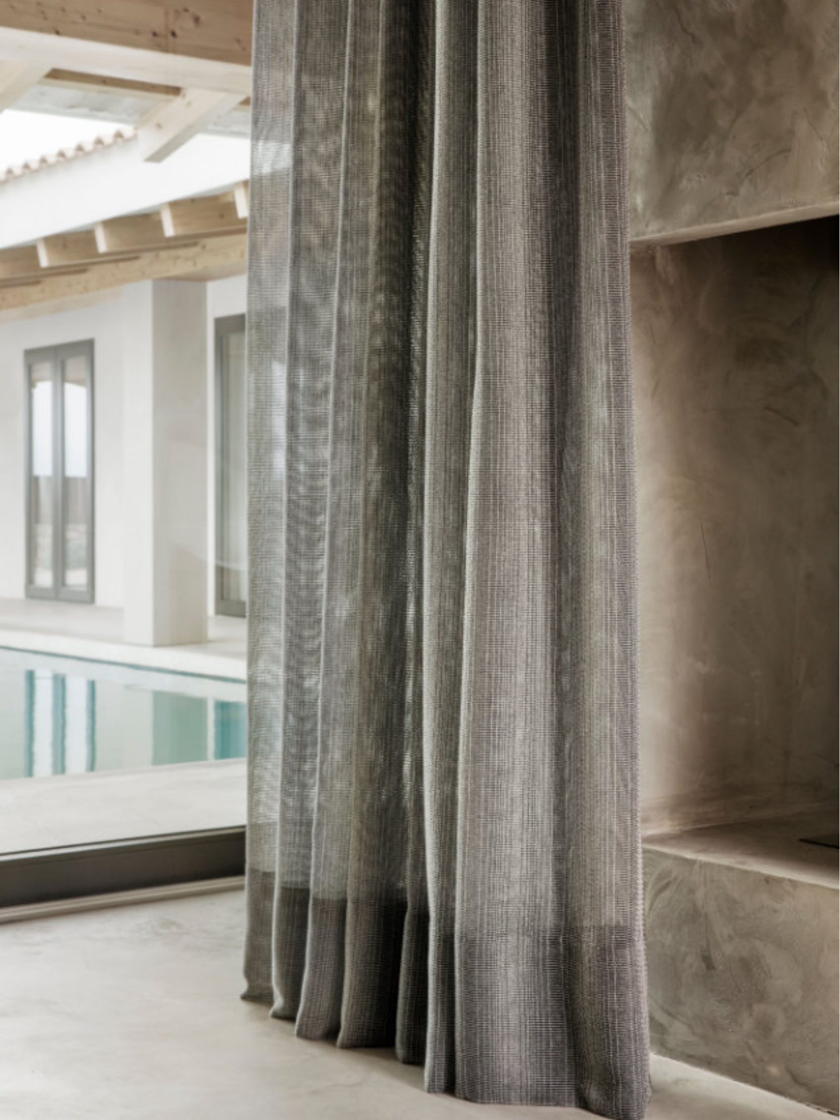
Sheer Aalto 19