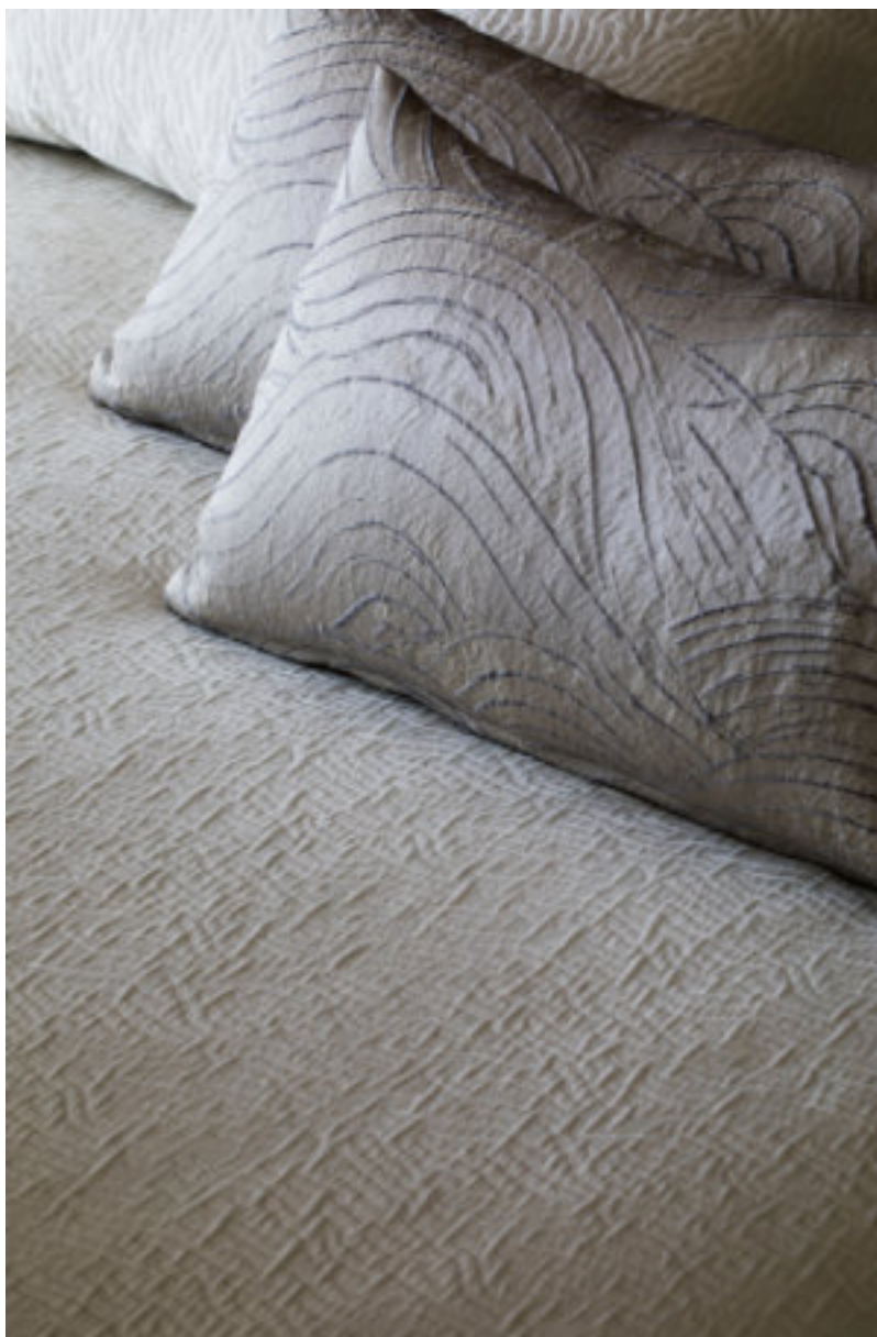
Bedlinen Onsen 06, Cushions Mizu 06